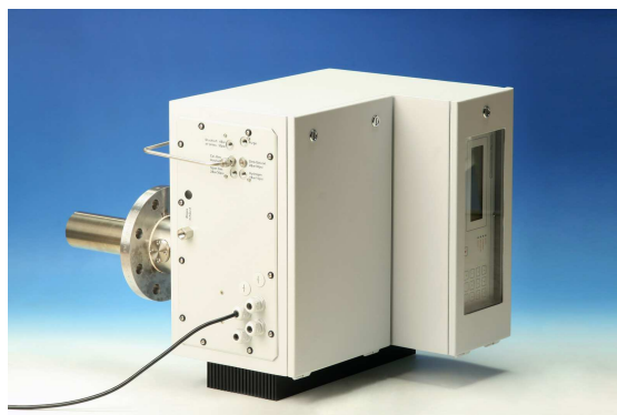
Lower side FID MK IP65