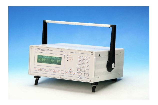
Front PT63/LT with stand