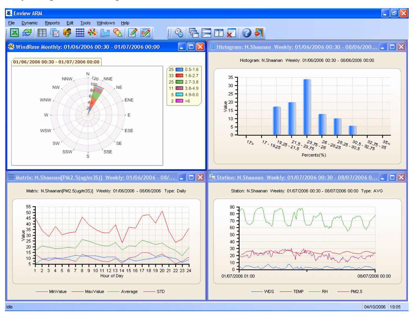
Envista Air Resources Manager Overview

Envista ARM is a Windows Vista, client-server application for supervisory control, management and analysis of data from Environmental, Meteorological and Hydrological monitoring networks.